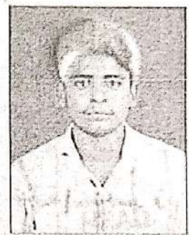
Department Andhra University Visakhapatnam